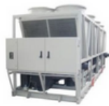
Variable Speed Chillers