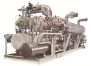
Hazardous Area Chillers