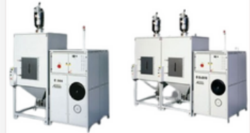
Plastic Auxiliary Equipment