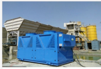
Batching Plant Chillers