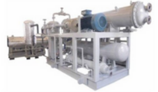
Industrial Refrigeration System