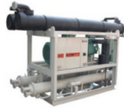
CO2 Based Chillers