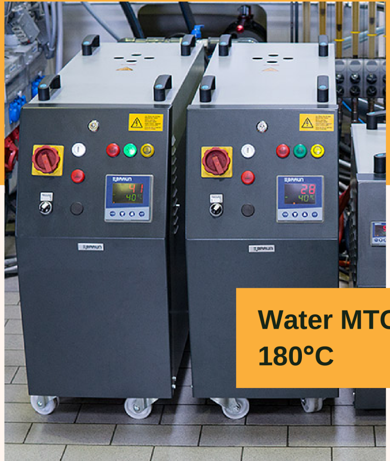
Water MTC 180°C