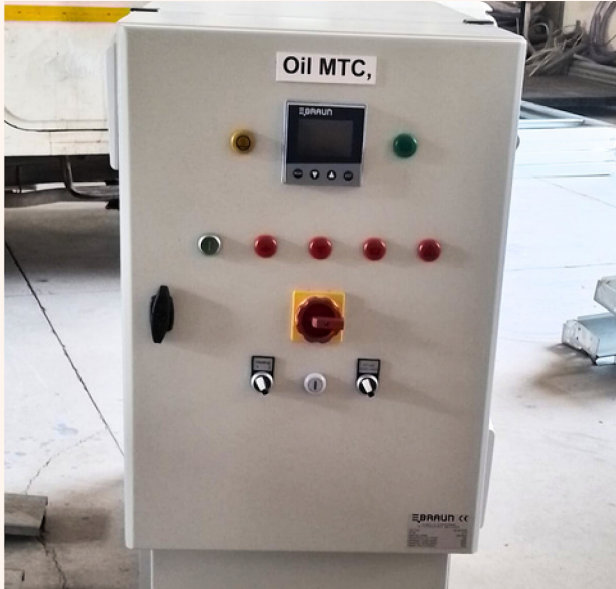
Oil MTC 350°C